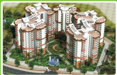
Shriram Symphonye, Off Kanakapura Rd, Bangalore