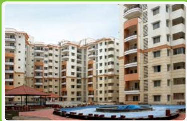
Shriram Samrudhi, Whitefield, Bangalore