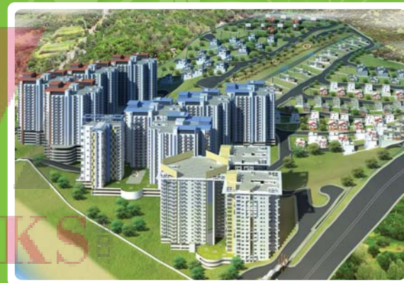
Shriram Panorama Hills, Vizag