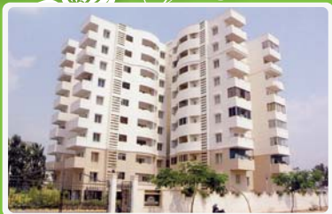
Shriram Srishti, Anand Nagar, Bangalore