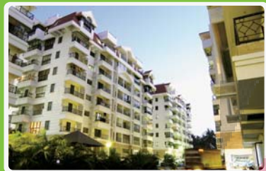
Shriram White House, R.T. Nagar, Bangalore