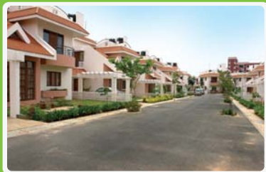
Shriram Samskruthi, Whitefield, Bangalore