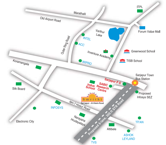
Location Map of the Future Hotspot